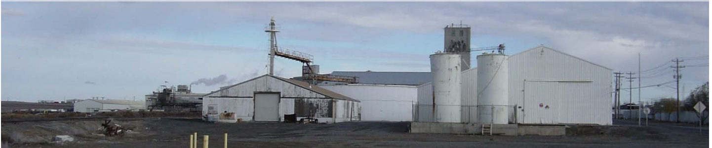
The Simplot Growers Solutions facility where pesticide contamination was found.