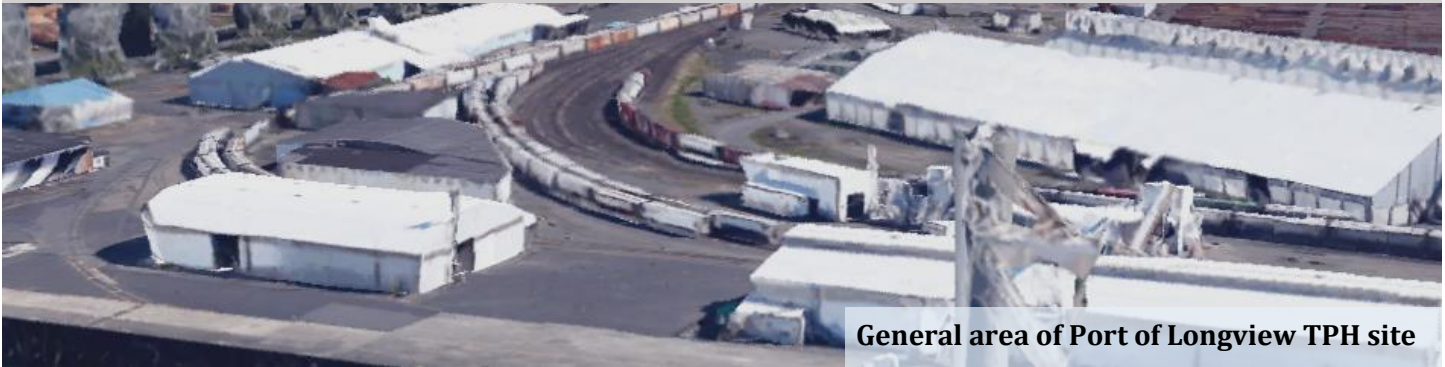
General area of Port of Longview TPH site