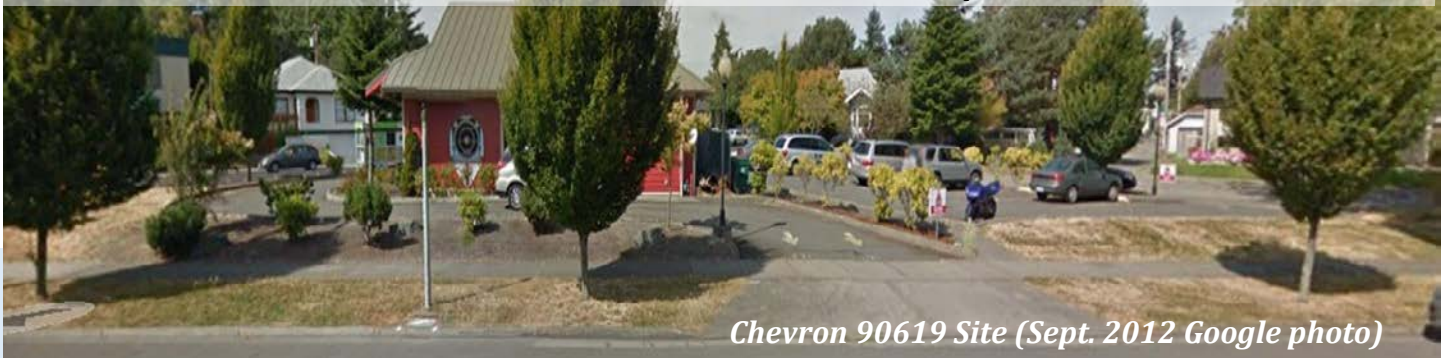
Chevron 90619 Site (Sept. 2012 Google photo)