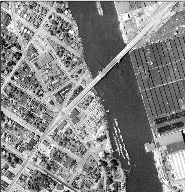
South Park Marina historical picture