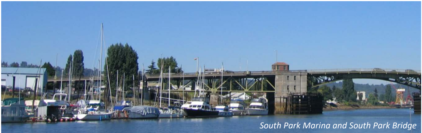
South Park Marina and South Park Bridge