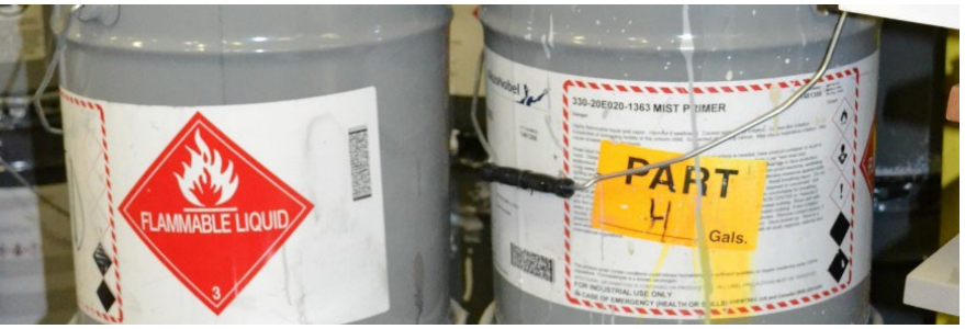
Figure 3: When in doubt, refer to the regulations or contact an inspector from your regional Ecology office.

All rules and requirements for waste labels are in the <u>Dangerous Waste Regulations</u>.<sup>8</sup> Read them carefully as you may have special circumstances that require other labeling. You can <u>view the regulations</u> <u>online or request a free copy</u>.<sup>9</sup>