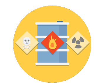
Figure 2: Dangerous waste can have more than one hazard. Remember to label all hazards of your waste.