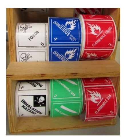
Figure 1. Hazard label stickers state potential risks that wastes pose to those who handle them.

Labeling rules typically apply to medium and large quantity generators; however, we highly encourage small quantity generators to label waste as a best practice.