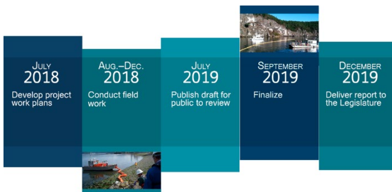
GRP updates timeline

We have begun to update geographic response plans to identify water column and subsurface resources that could be harmed by oils that submerge or sink. A progress report will be provided to the Legislature. Community input will be part of the update process.