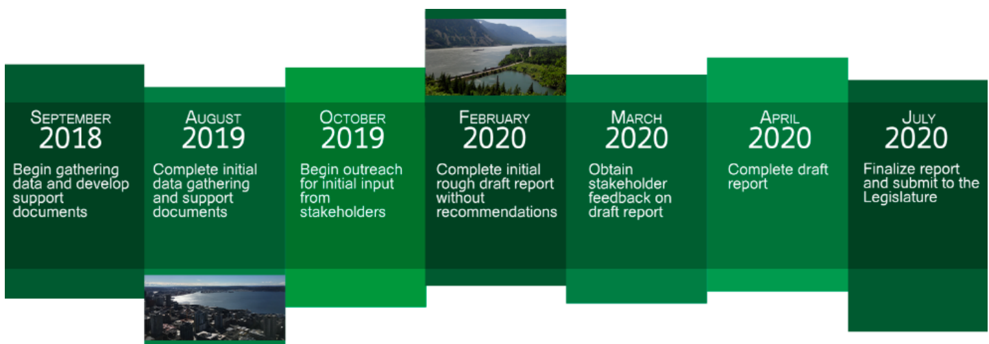
Program activities and funding report timeline

Deliverable: Report to the Legislature by July 1, 2020, with recommendations on program activities and funding.