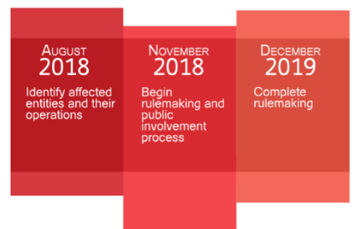
Contingency plan updates timeline

Deliverables: Adopted rules, updated contingency plans, and approved spill management team applications by December 2019.