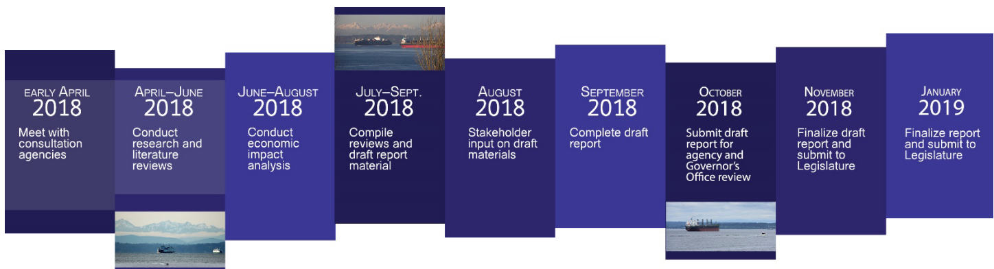
Vessel traffic safety report timeline

Deliverables: The preliminary report was provided in December 2018, and a final report on January 11, 2019.