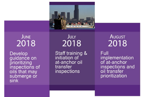
Transfer inspection prioritization timeline