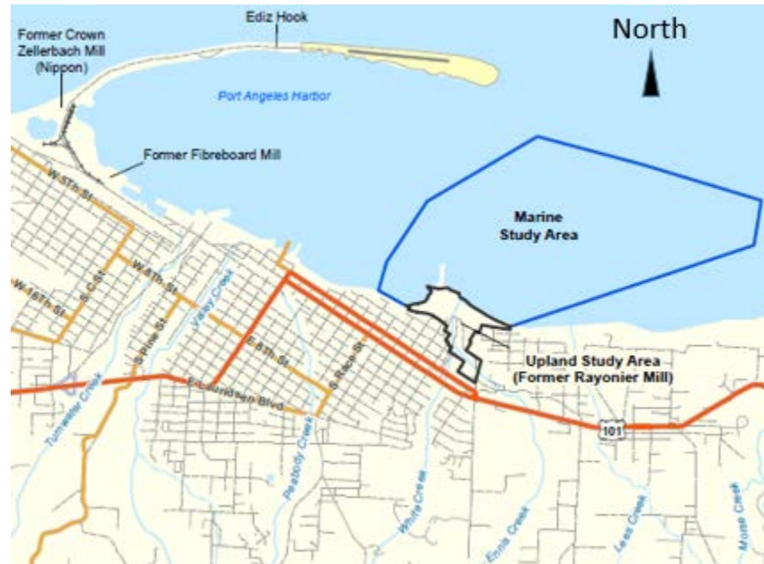
Figure 1: The Rayonier Mill Study Area is located along the shoreline and in the eastern portion of Port Angeles Harbor.

RayonierAM leased the northern portion of the property from the Washington State Department of Natural Resources (DNR) which includes a dock and jetty.