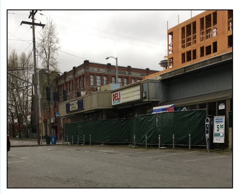
Texaco 211577 Monterey Site picture