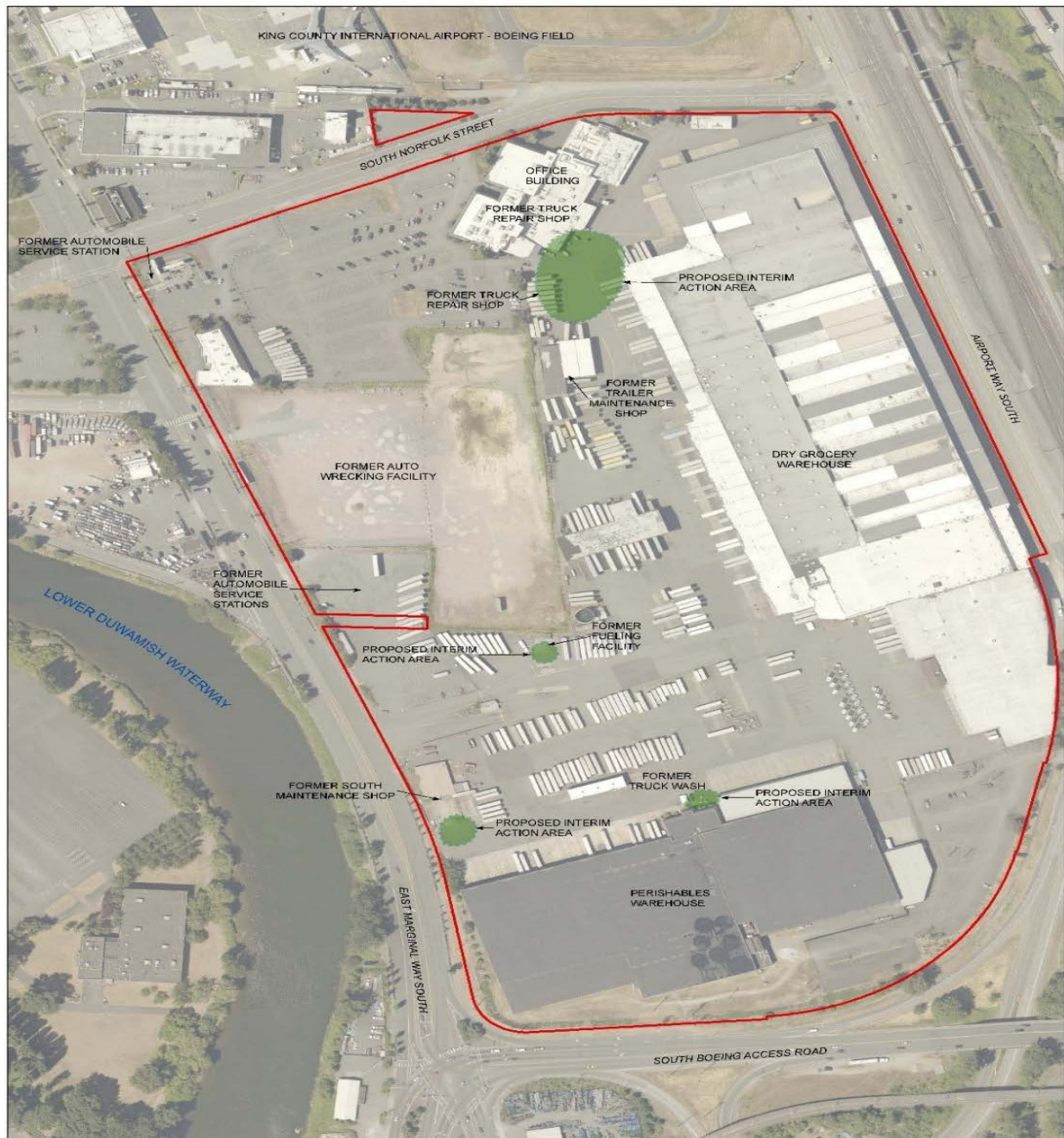
Emerald Gateway Site – Interim Action Work Plan Figure