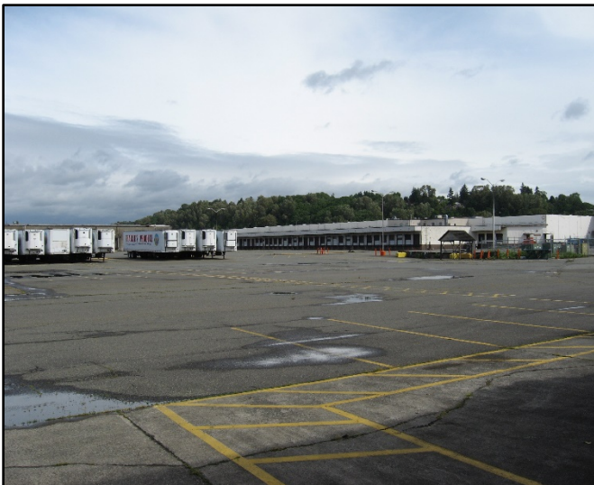
View of the Emerald Gateway Site