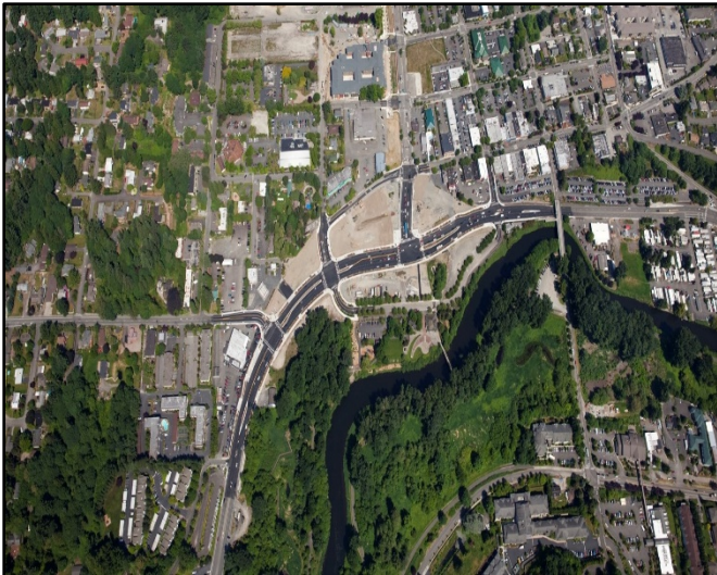
Bothell Riverside Site & surrounding area