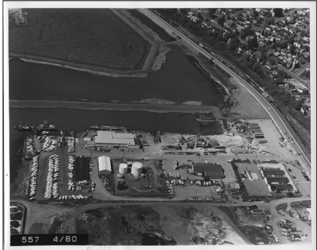
I & J Waterway facing northwest, April 1980 1

The study found polycyclic aromatic hydrocarbons (PAHs), phthalates, phenols, and nickel in marine sediment. These contaminants are likely related to historic activities, including: lumber mill operations, rock crushing, food/seafood processing, and stormwater inputs. A building fire also likely contributed to the contamination.