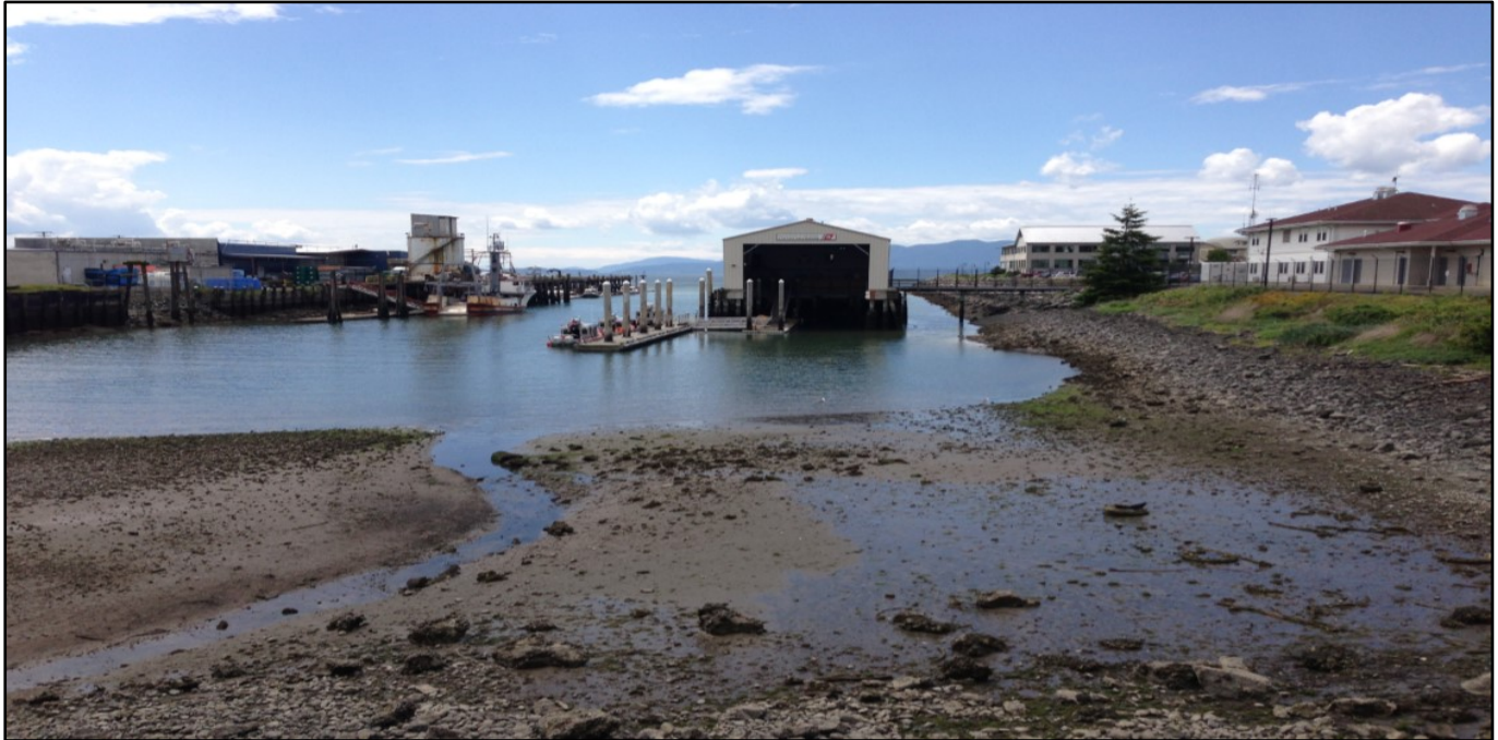
I & J Waterway looking southwest, November 2014