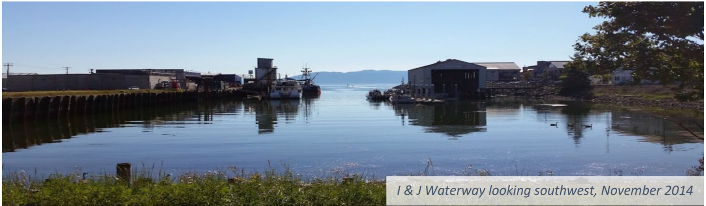
I & J Waterway looking southwest, November 2014