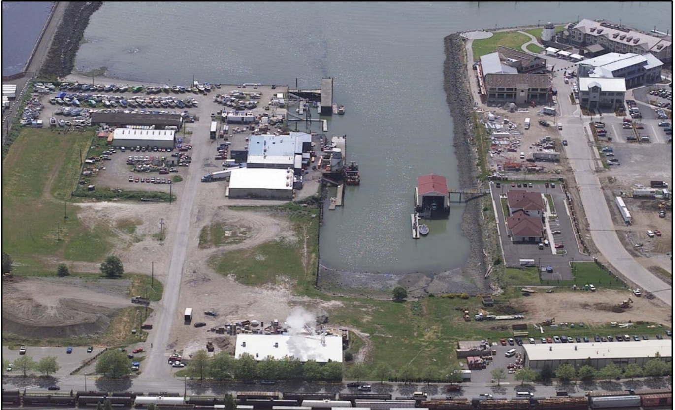
I & J Waterway looking southwest, May 2001