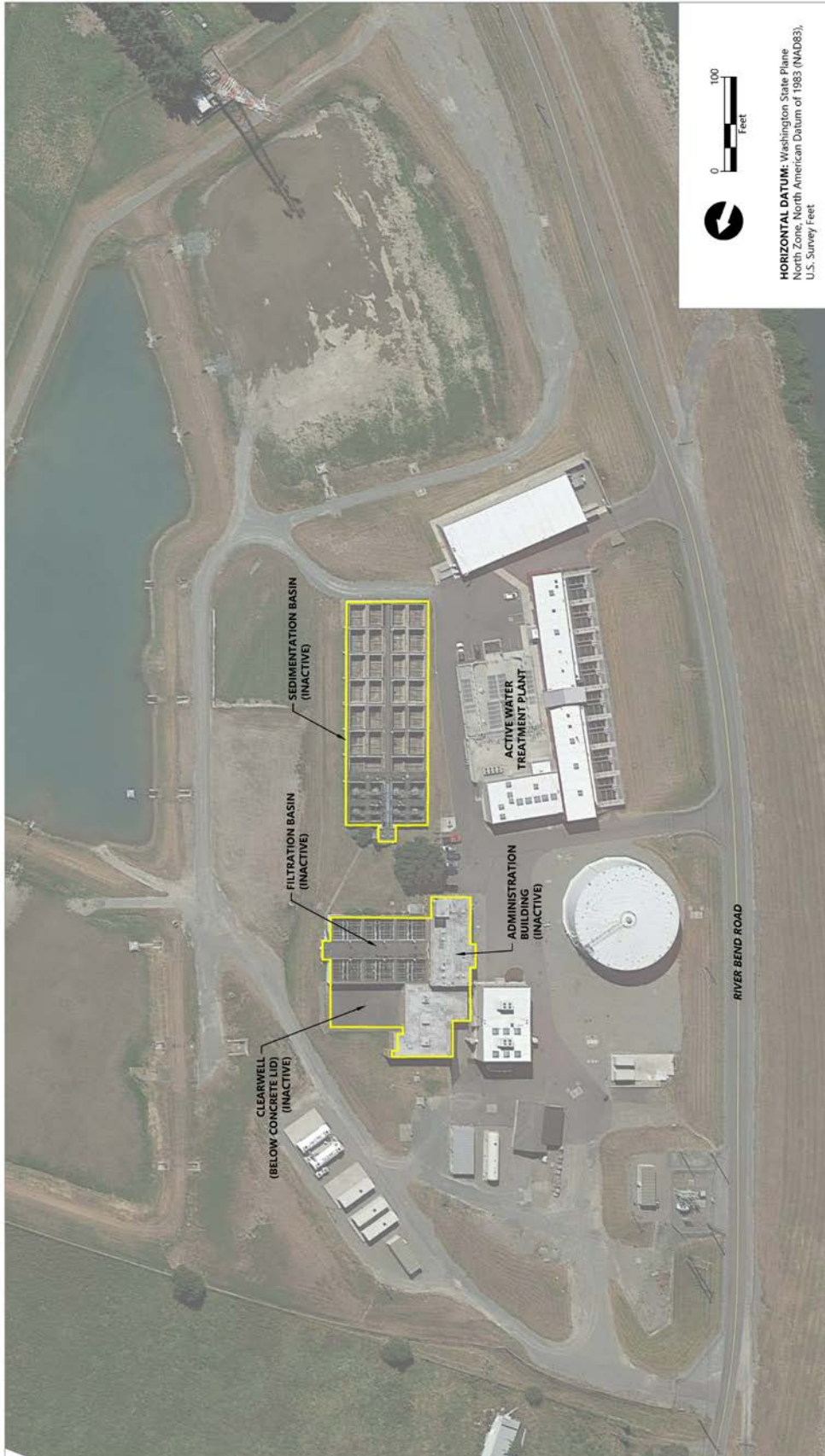
Site Location Diagram

Publication Date: 2019/03/15 4:13 PM | User: hennrich Filepath: E:\Projects\313E-Foster-Popper-RI-C\Former-Anacortes-Water-Treatment-Plant_U\Feasibility-Study\313E-SP-002_Site-Location-Diagram.dwg Site Location Diagram.dwg Site Location Diagram