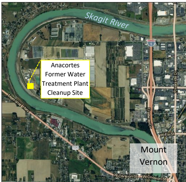
Aerial view of cleanup site area