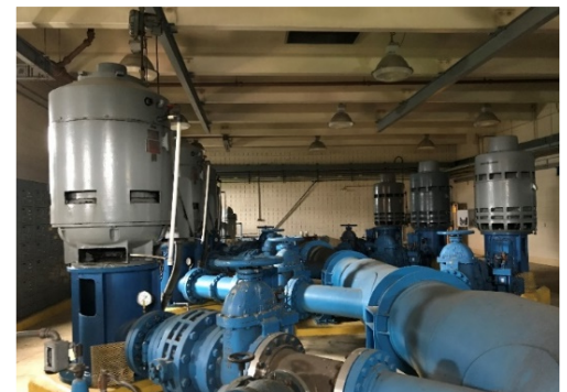
Decommissioned Pump Room below Administration Building, March 2018