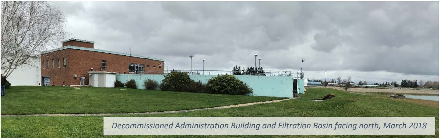
Decommissioned Administration Building and Filtration Basin facing north, March 2018