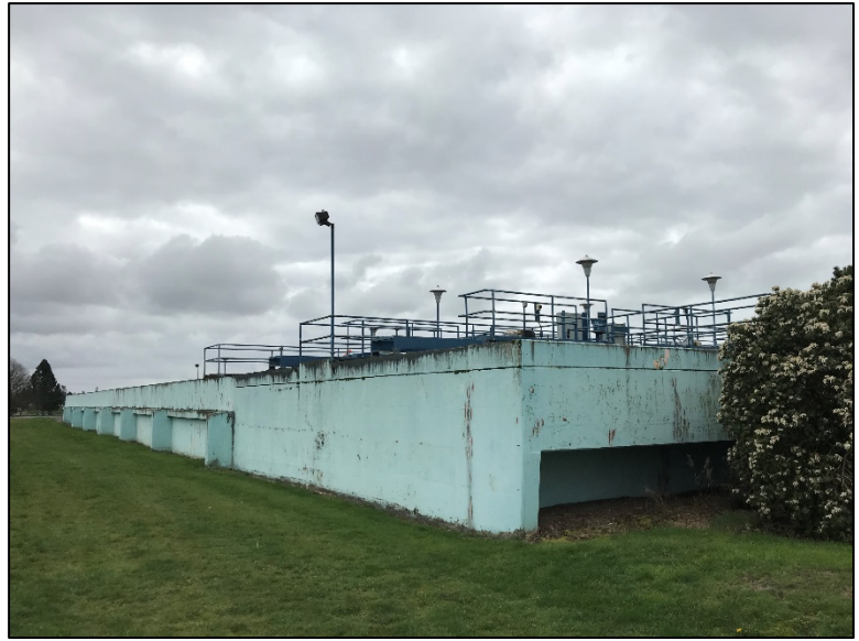
Decommissioned Sedimentation Basin facing south, March 2018