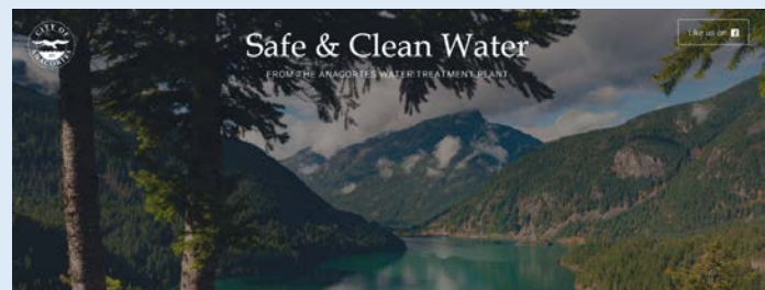
City of Anacortes Safe & Clean Water website: www.safeandcleanwater.com