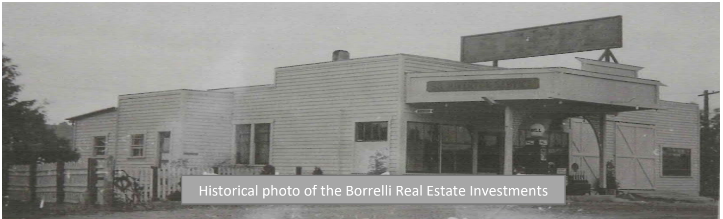
Historical photo of the Borrelli Real Estate Investments