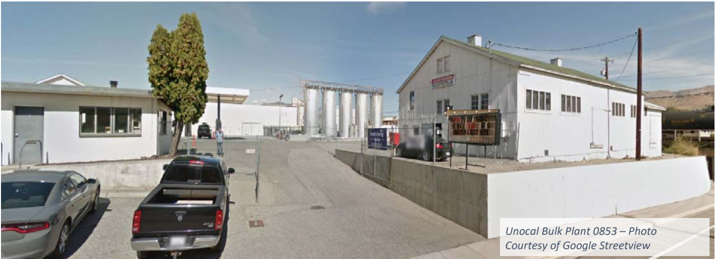
Unocal Bulk Plant 0853