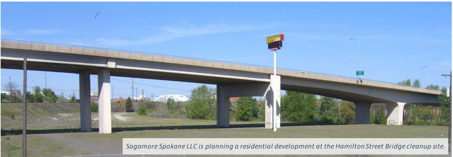
Sagamore Spokane LLC is planning a residential development at the Hamilton Street Bridge cleanup site.