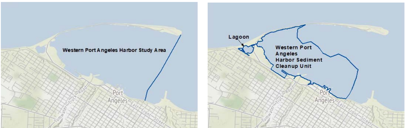
Figure 1. Western Harbor Study Area (left) and Western Harbor Sediment Cleanup Unit (right).

At first, Ecology did not know how contaminated the sediment was or where the contamination was located. By sampling in the Western Harbor Study Area, Ecology learned where sediment contamination is above state cleanup levels. This area is called the Western Harbor Sediment Cleanup Unit (see Figure 1).