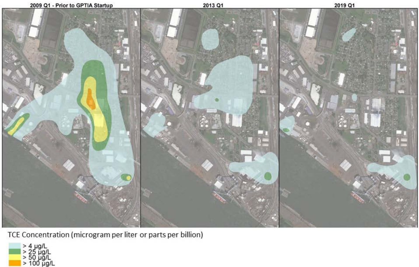
Figure 2. Reduction in the size and concentration of the TCE plume in groundwater in the intermediate depth zone over time from 2009 (left) to 2019 (right).

Figure 2 shows interim actions have greatly reduced the amount of TCE in groundwater over time. These concentration measurements are from the intermediate depth zone, about 40 to 140 feet below the surface of the ground. TCE concentration is measured in parts per billion (ppb). One ppb is a small number, try imagining about 1 second in 32 years.