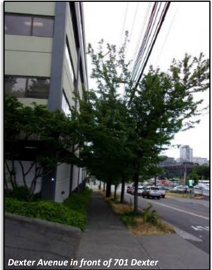
Dexter Avenue in front of 701 Dexter

Due to the COVID-19 emergency, Ecology is hosting public meetings online until such time as it is deemed safe and appropriate to host physical meetings again.