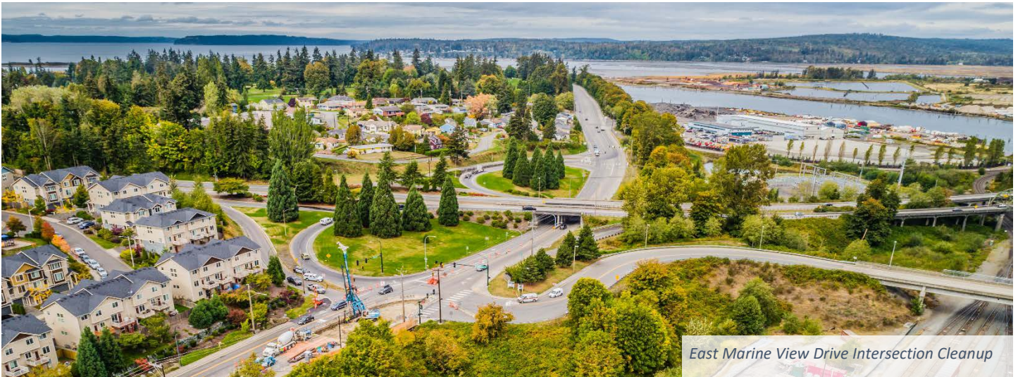
East Marine View Drive Intersection Cleanup