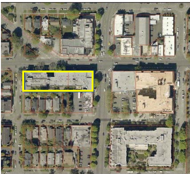
Sawirka hawada ee Stone Way Apartments.

Tarjumaadda waxaa lagu bixiyay Isbaanish, Tigrinya, Oromo, Kantonese, iyo Amxaar.