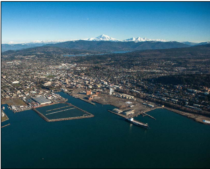
Bellingham Waterfront, December 2014.