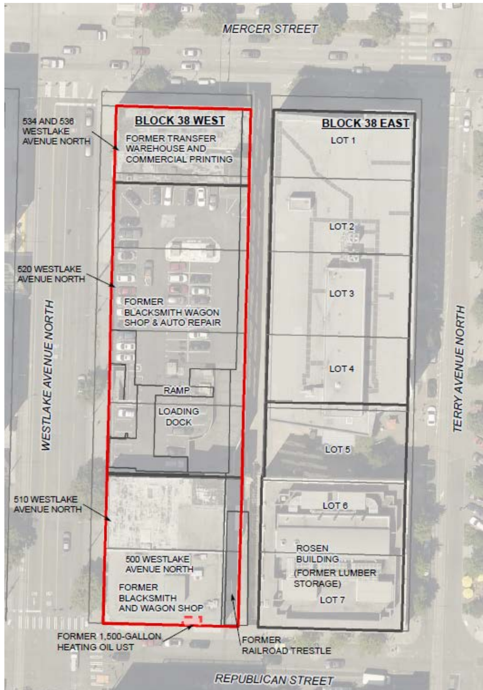
Figure 1: Block 38 West property map with historic features. Farallon 2019.

An independent cleanup action (without Ecology oversight) is currently ongoing at the Site in connection with redevelopment.