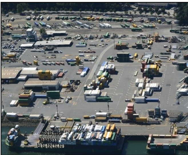
View of the Terminal 115 Plant 1 Site