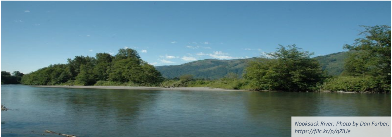
Nooksack River; Photo by Dan Farber, https://flic.kr/p/gZiUe