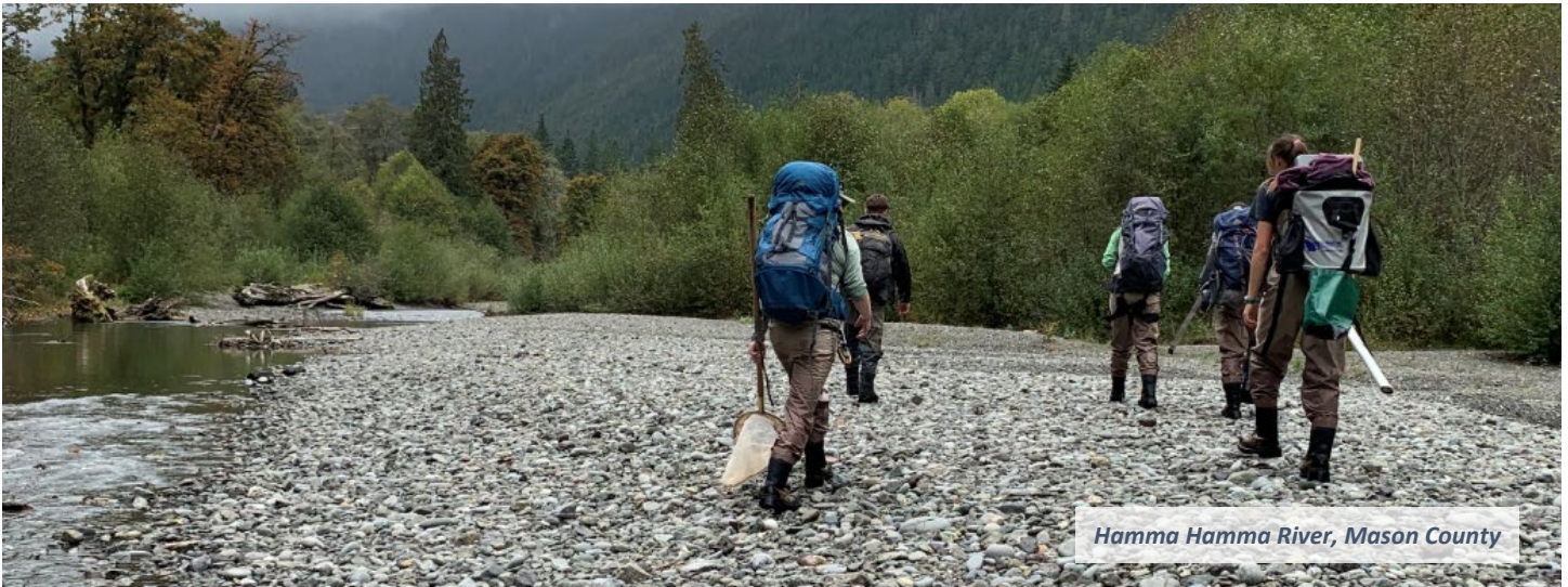
Hamma Hamma River, Mason County