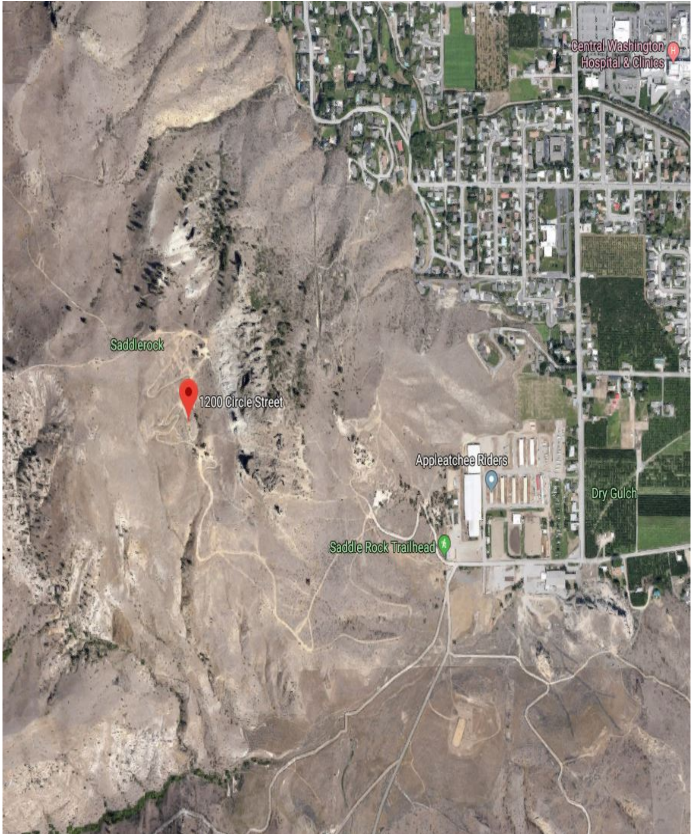
Map courtesy of Google Maps