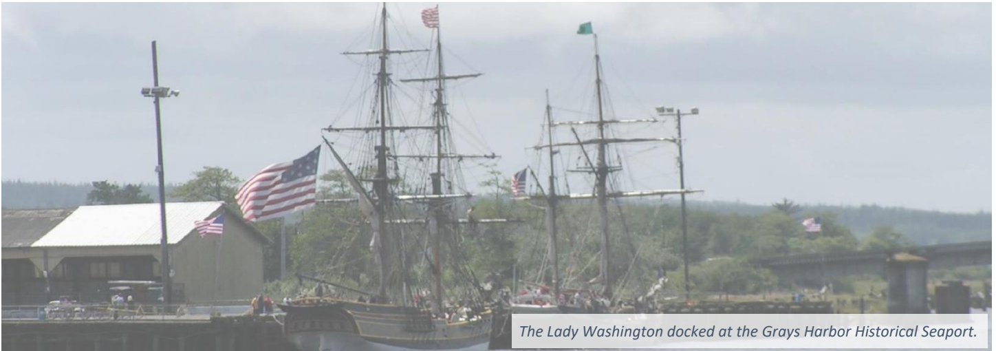
The Lady Washington docked at the Grays Harbor Historical Seaport.