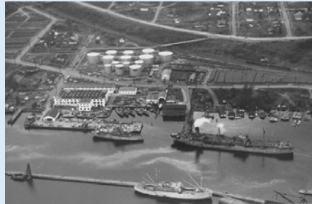
Historical Aerial View of Time Oil Properties

Ecology has negotiated a legal agreement called an Agreed Order with BNSF Railway for its property within the Time Oil Bulk Terminal Cleanup Site. The order names them a Potentially Liable Person (PLP) and requires them to address contamination on their property.