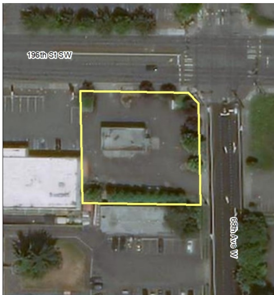
Aerial view of the Texaco Strickland Site