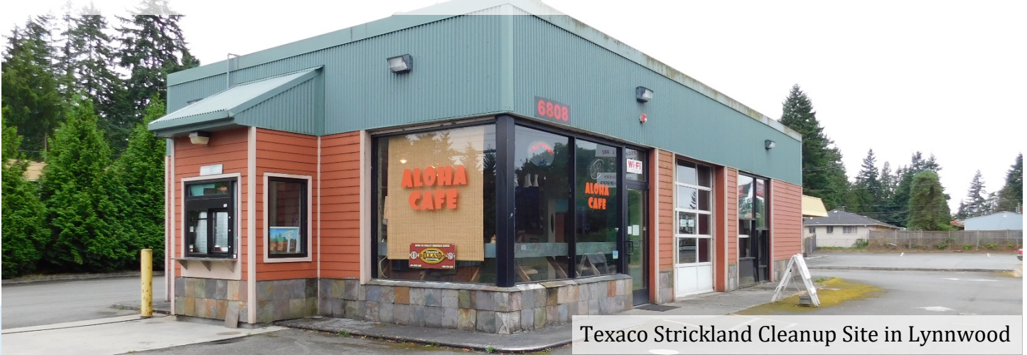
Texaco Strickland Cleanup Site in Lynnwood