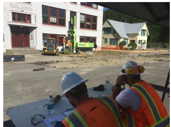
Hot water flushing system well installation, 2015

In 2018 Ecology approved the removal of the hot water flushing system and restoration of school property. Monitoring of groundwater wells on and around school property continues as required in the Long Term Monitoring Plan.