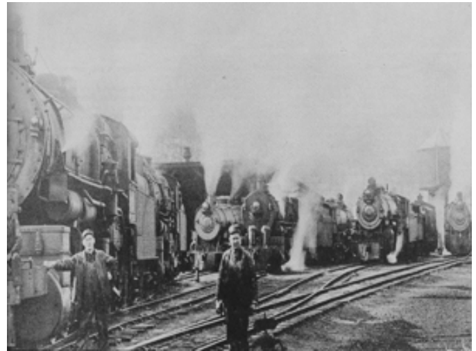
Historic Skykomish Railyard

The cleanup in Skykomish was very disruptive for residents to endure. However, the community came together and worked with Ecology and BNSF Railway to get it accomplished.