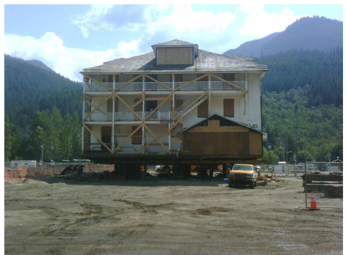
Temporarily moving the Skykomish Hotel, 2009