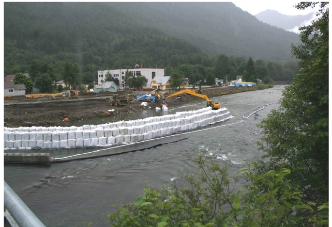
Skykomish River bank work, 2006