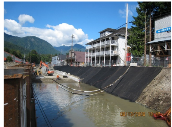
HCC System construction on Railroad Avenue, 2008