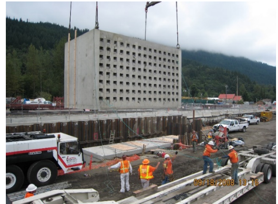
Installation of HCC treatment gate system, 2008

The HCC System was installed in 2008, and the active groundwater pumping-system operated from 2009 to 2019. In 2018, BNSF proposed operating it with the passive system components only, plus the light non-aqueous phase liquid (LNAPL or petroleum products that float on top of groundwater) skimmers. Prior to the HCC System installation, isolated areas of LNAPL were observed across the railyard. Operation of the HCC System was successful at concentrating areas of LNAPL to the system’s collection trench, oil-water separators, and extraction wells. Proposed “passive” operation of the HCC System included the operation of skimmers to collect LNAPL from the extraction wells and oil-water separators at the gates. Over the years of HCC System operation, LNAPL has diminished to trace amounts in the recovery wells and oil-water separators such that active skimming and pumping from recovery wells may no longer be necessary in the future. Dissolved phase petroleum is removed from groundwater leaving the BNSF property by the activated carbon filters installed in the barrier wall gates. The HCC System was designed to provide the flexibility to allow incremental shutdown of portions of the system as remediation progresses. Passive operation provides an opportunity to meet cleanup standards, while reducing the operational environmental footprint.