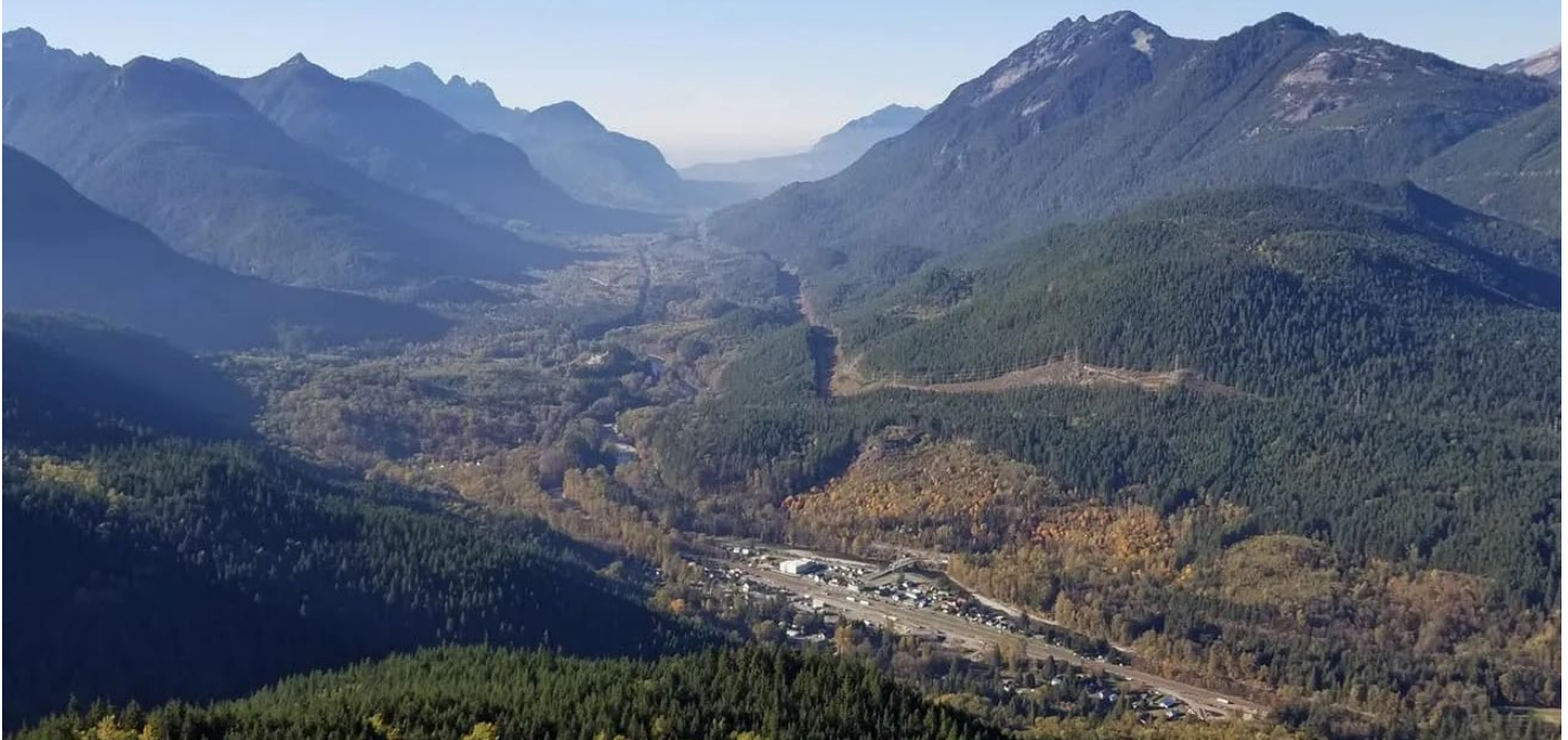
Town of Skykomish