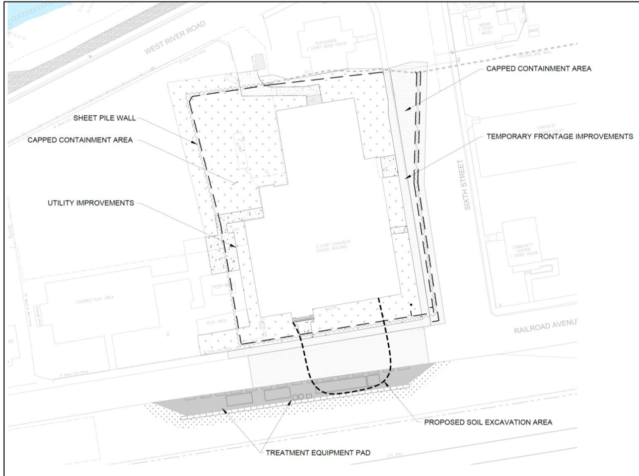
Skykomish School construction site plan