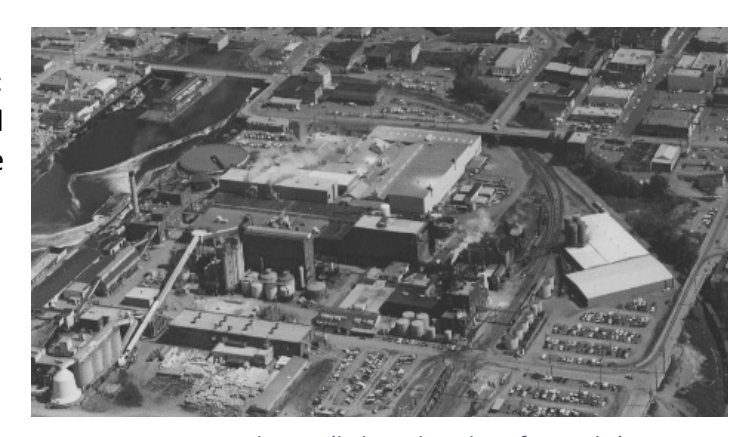
Lignin warehouse (light-colored roof on right) and storage tanks, 1974

The Lignin Operable Unit portion of the Georgia-Pacific West cleanup site was the location of a warehouse and above ground tanks. The warehouse was used to store manufactured lignin products and the tanks contained liquid waste from the lignin process. (Lignin is a resin byproduct of the paper pulping process and can be converted into various consumer products such as vanilla flavoring, adhesives, pharmaceuticals, dust retardants, etc.) The warehouse and tanks are gone, but foundations, pavement and railroad spurs are still present on the property.