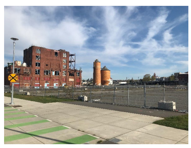
Lignin tour entry gate off W. Laurel Street

This tour is funded through a Public Participation Grant from Ecology.