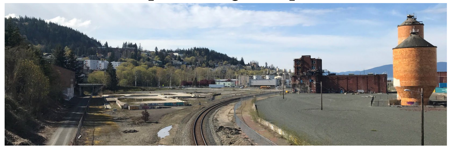
Lignin Operable Unit (left of railroad tracks), April 2022