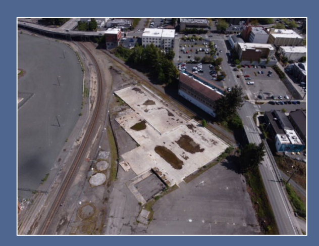
Aerial view of Lignin Operable Unit and downtown Bellingham, May 2021