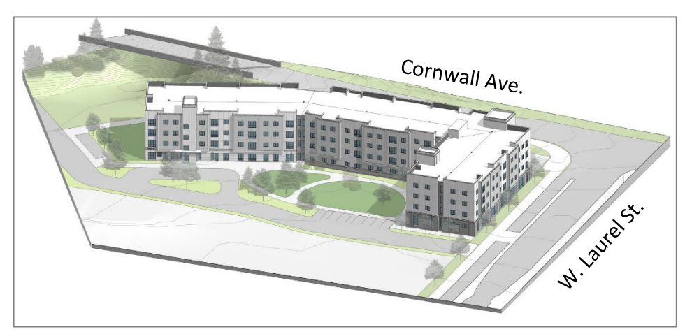
Aerial view of Mercy Housing Northwest's redevelopment vision

After the Port cleans up the Lignin Operable Unit, Mercy Housing Northwest<sup>4</sup> (a non-profit afforable housing developer, owner, and service provider) will purchase a portion of the property from the Port and enter into a legal agreement with Ecology to settle their cleanup liability. The legal agreement also outlines continued property access for cleanup monitoring and requires Mercy's