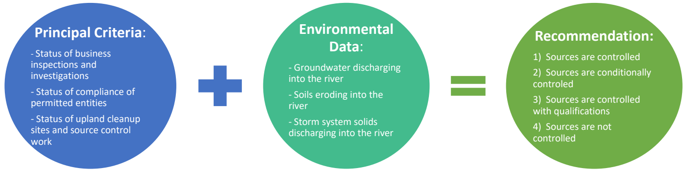
Figure 4: Process for LDW Source Control Sufficiency evaluations and possible recommendations for EPA.