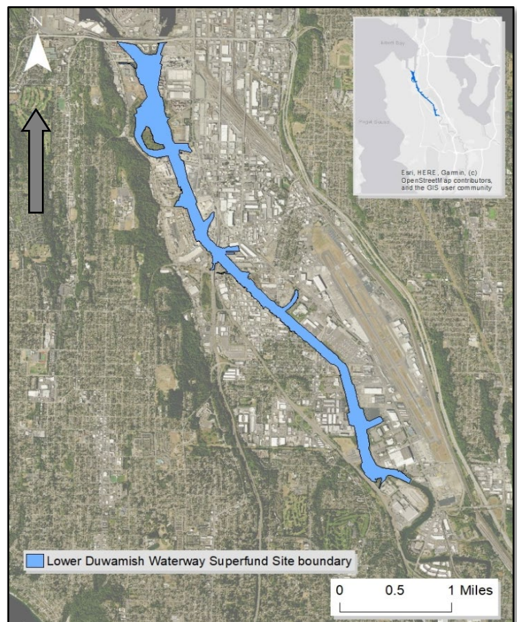
Figure 1: The Lower Duwamish Waterway (LDW) Superfund boundary for the river cleanup.

LDW Source Control: Finding sources of contamination that are entering the LDW Superfund Site from lands surrounding the river, and then taking actions to stop or reduce them before they reach the LDW.