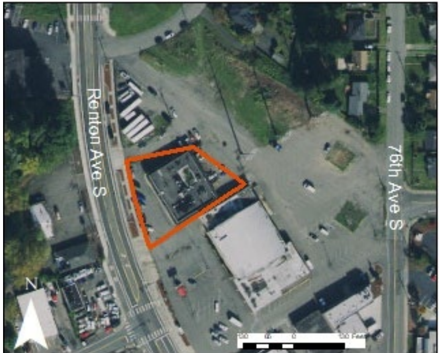
Aerial view of site, present day.

The affordable units will be available for rent at 60%-80% of the area median income (AMI). The AMI is calculated annually by the Department of Housing and Urban Development for each county. Design elements for this space will be selected using community input and work from local artists. If you have questions or comments on the redevelopment of this property, please comment here. https://bit.ly/SkywayTowncenter