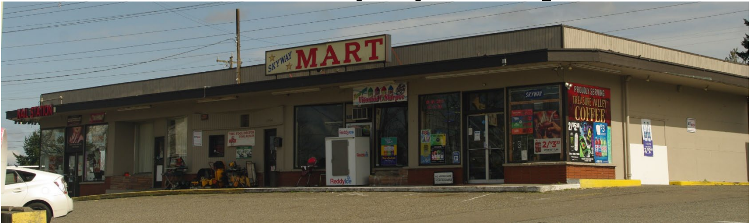
Boathouse Inc Renton Skyway Cleanup Site (12548 Renton Ave. S., Seattle)