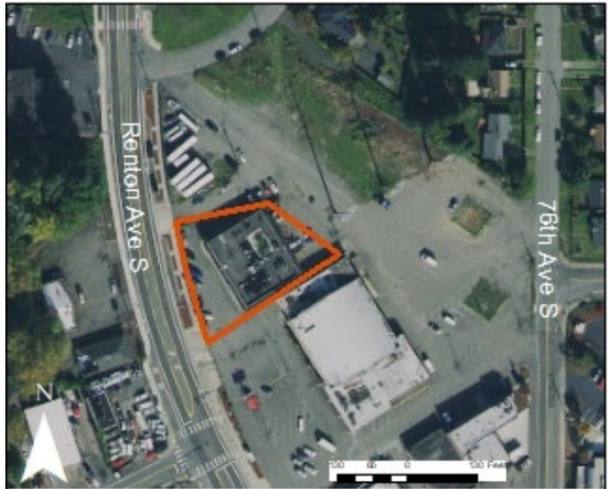
Muuqaalka hawada laga qaaday ee goobta, maanta.

Dhammaan waxyaabahaan wasakhda keenaya waxaa laga helay heerar ka sareeya sharciga nadiifinta gobolka, Xeerka Xakameynta Nidaamka Sunta (Model Toxics Control Act, (MTCA 1 )). Xeerka Xakameynta Nidaamka Sunta (Model Toxics Control Act, MTCA) wuxuu dhigayaa in wasakhdaan la nadiifiyo.