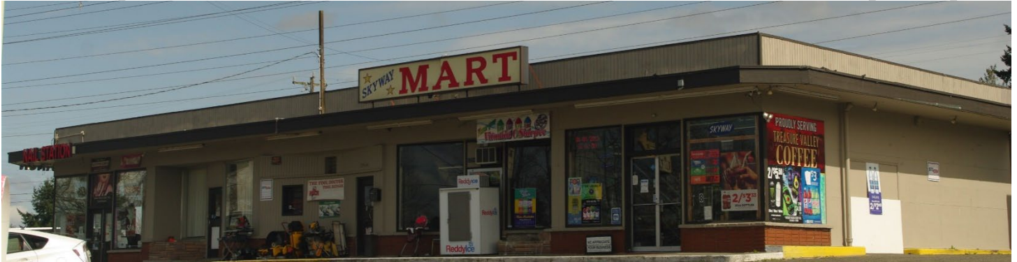
Goobyaa Nadiifinta Boathouse Inc Renton Skyway