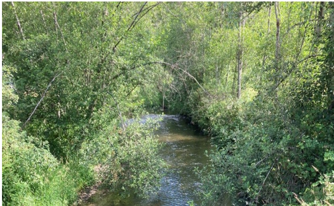
Big Soos Creek

Areas of the Soos Creek watershed don't meet Washington State water quality standards for temperature, dissolved oxygen (DO), or bacterial pollution. We're developing a water quality improvement project (often called a TMDL) to restore and improve conditions for aquatic life and for people who swim, fish, or otherwise recreate in this watershed.