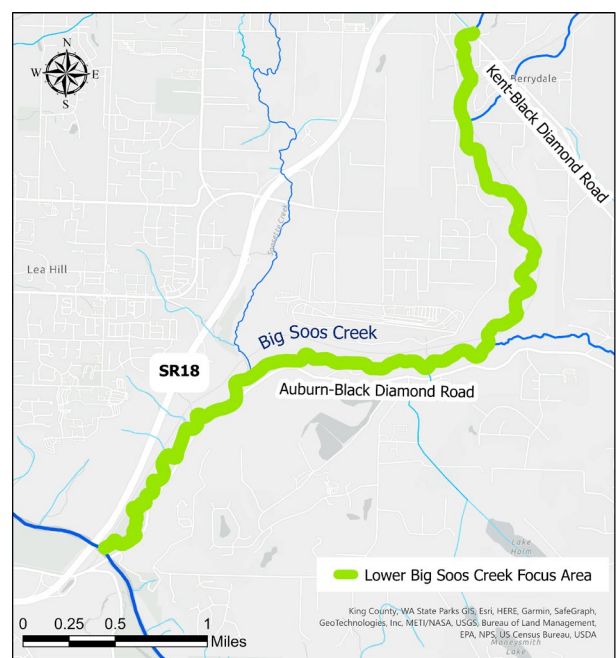
Map of Big Soos Creek (King County)