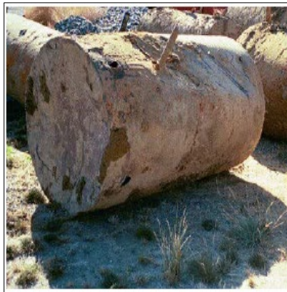
Figure 1: Removal of leaking underground storage tanks at Public Works facilities is a common use of Independent Remedial Action Grants.