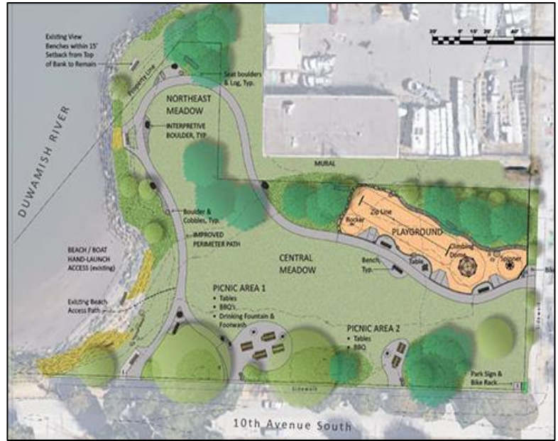
Sawirka farsamo ee muujinaya hormarka wakhtiga iyo la sugayo ee

Asxaabta Duwamish Waterway Park waxa uu hogaaminayaa dadaalka sanado badan oo lagu turjubayo himilada bulshada ee beeraha nasashada xaafada ee rasmiga ah ee nashqada ugu danbaysa. La shaqaynta SPR iyo Seattle Parks Foundation, Friends of Duwamish Waterway Park waxa ay uruuriyeen malaayiin doolar oo hormarinta beerta nasashada. Dhismaha waxaa la dhameeyay dhamaadka 2022. Hagaajinta goobtu waxay bilaabantay 2020 oo ilaa maanta way soo socotaa.