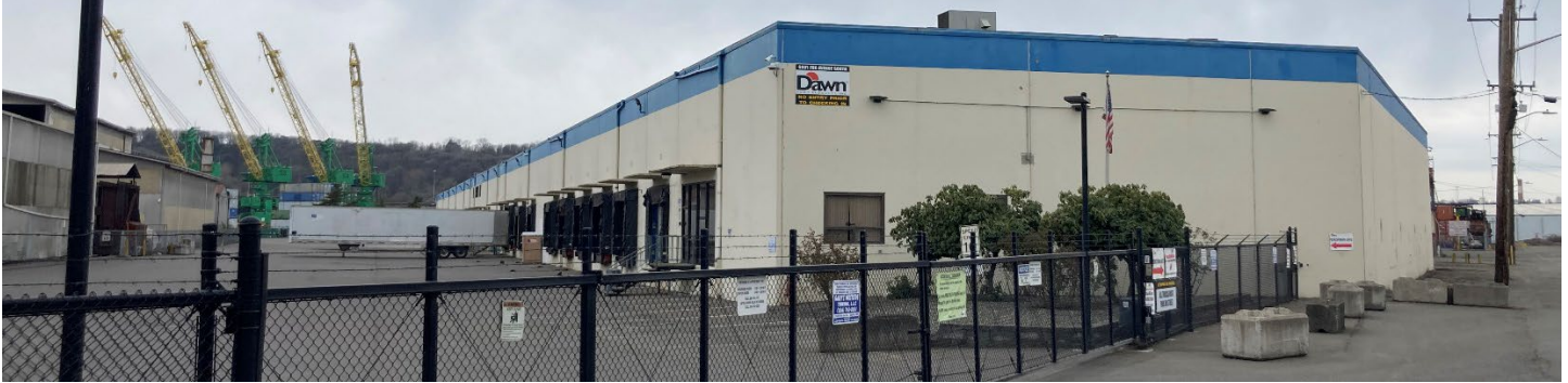
Dawn Food Products Main Building