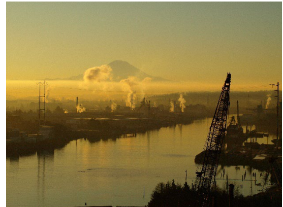
View of Lower Duwamish Waterway

The Dawn Food Products site is adjacent to the Lower Duwamish Waterway 1 Superfund Site, which includes a 5-mile stretch of the Duwamish River. The U.S. Environmental Protection Agency (EPA) added the LDW Superfund Site 2 to the Superfund National Priorities List in 2001. Ecology is working to stop or reduce sources of contamination to the LDW Superfund Site, an effort known as “ source control ” 3 , so that the EPA can proceed with the cleanup of the river sediment.