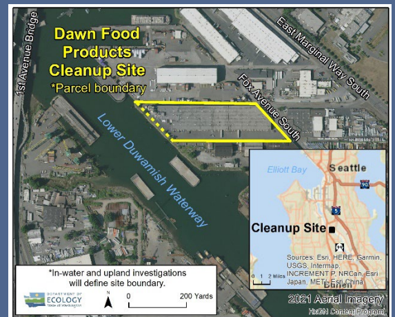
Aerial map of the Dawn Food Products cleanup site

To request an ADA accommodation, contact Ecology by phone at 425-533-5537 or email LDW@ecy.wa.gov , or visit ecology.wa.gov/Accessibility . For Relay Service or TTY call 711 or 877-833-6341.