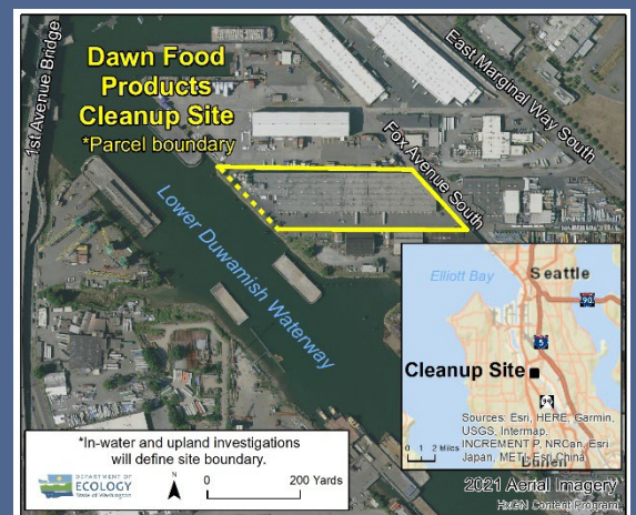
Khariirada guud ee Dawn Food Products nadiifinta goobta

Si aad u dalbato qaabilaada ADA, kala xidhiidh Bay'ada taleefanka 425-533-5537 ama iimeelka LDW@ecy.wa.gov , or visit ecology.wa.gov/Accessibility . Adeegyada Dadka Laxaadka La' ama TTY la hadal 711 ama 877-833-6341.