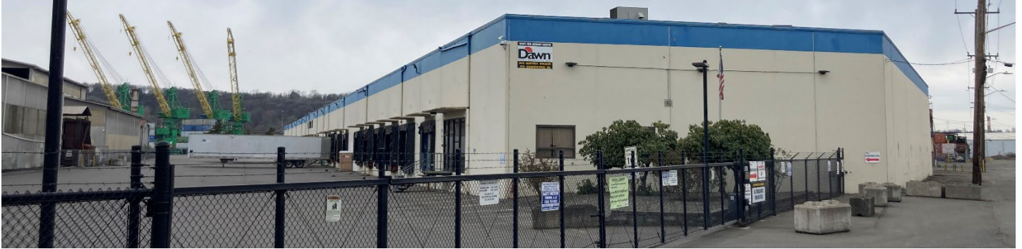
Dhismaha Wayn ee Alaabaadka Cuntada Dawn