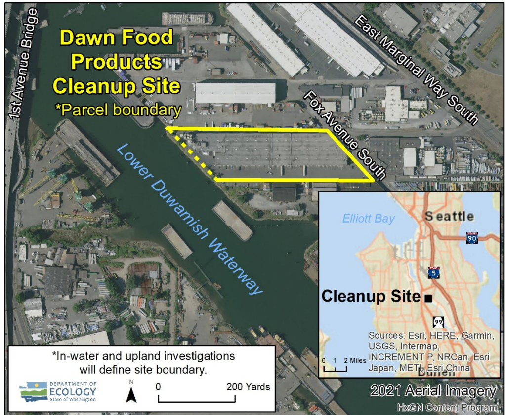
Aerial view of Dawn Food Products Parcel