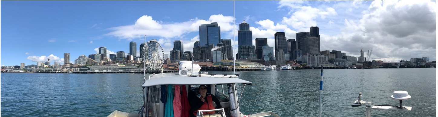
Ecology research vessel heading into Elliott Bay.