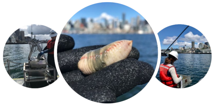
Ecology scientists sampling Elliott Bay sediments.