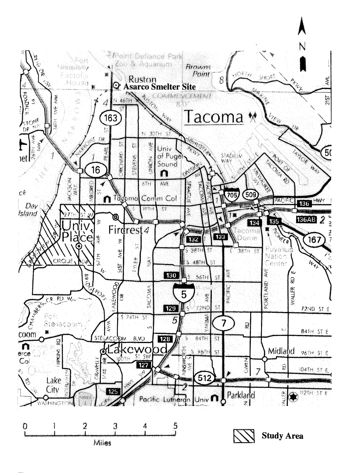
Figure 1 – Location Map – Typical Soils Arsenic Concentrations in Residential Areas of University Place.