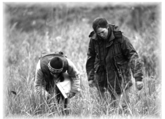
Ecology workers stop and smell the grasses.