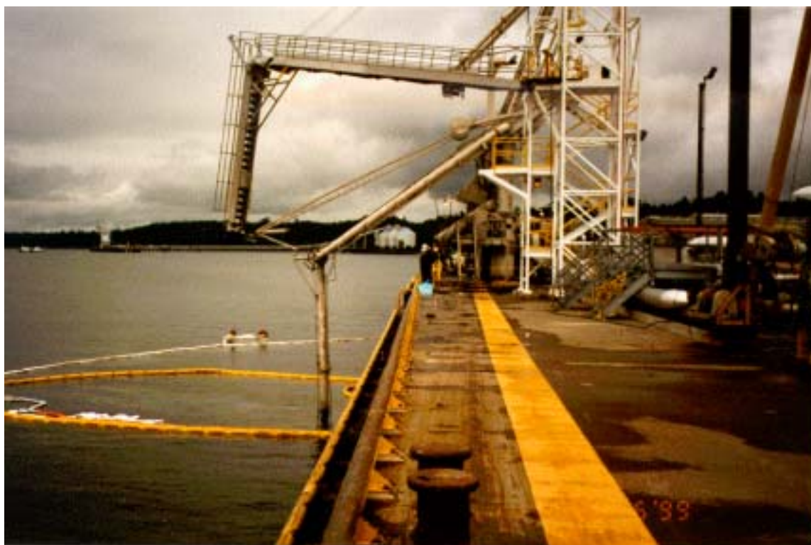
Figure 1. Picture shows damaged Mechanical Loading Arms and gangway at the Ferndale dock. View is to the north, showing dry-bulk dock in background. Note tugs moored off end of dry-bulk dock.

All times are approximate Pacific Daylight Time (PDT). Courses are referenced from True North.