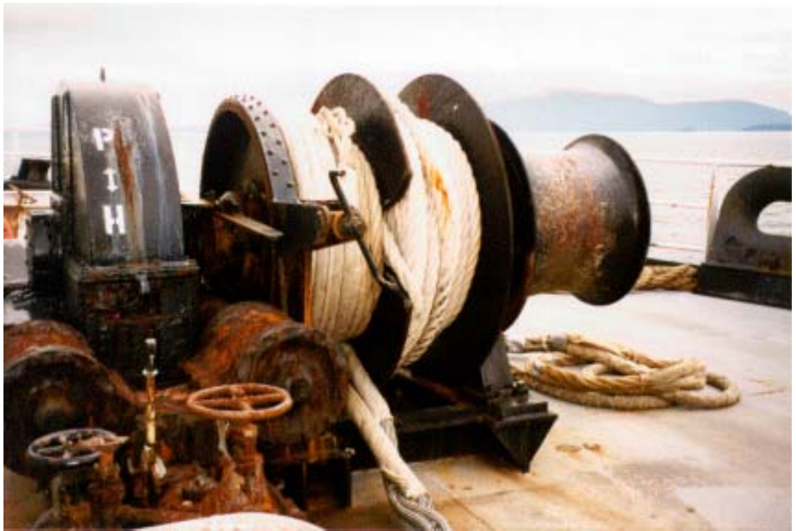
Figure 2. No. 1 mooring winch on bow of ARCO TEXAS. Note the dual (storage and working) drum design and the 2-inch Spectra® line. Two-prong handle at center is winch brake tightening mechanism.

The rated brake capacity of the mooring winches was 154,350 lbs. (68.9 long tons).