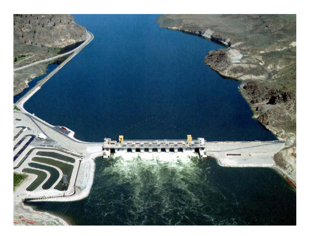
Figure E-3. Wells Dam