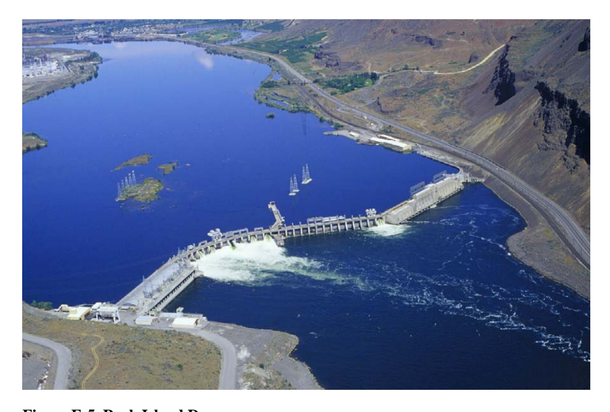
Figure E-5. Rock Island Dam