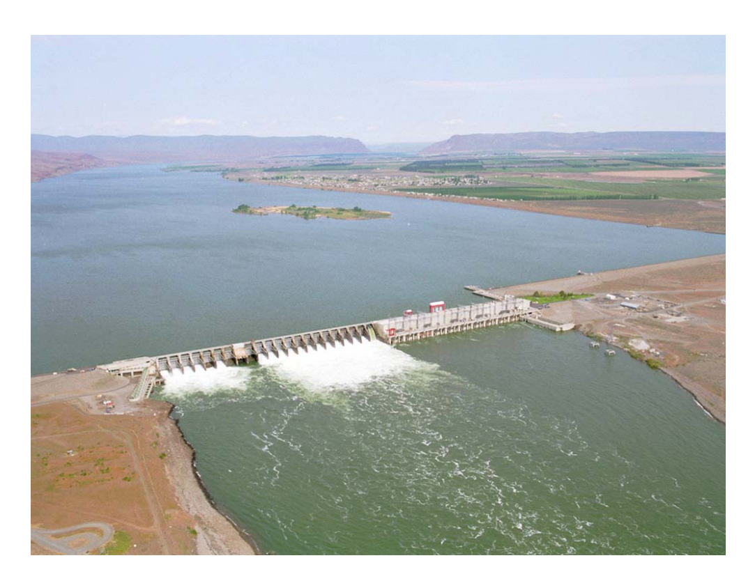
Figure E-7. Priest Rapids Dam