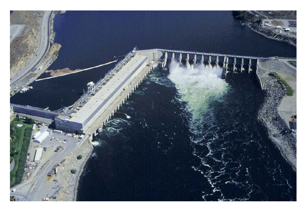
Figure E-4. Rocky Reach Dam