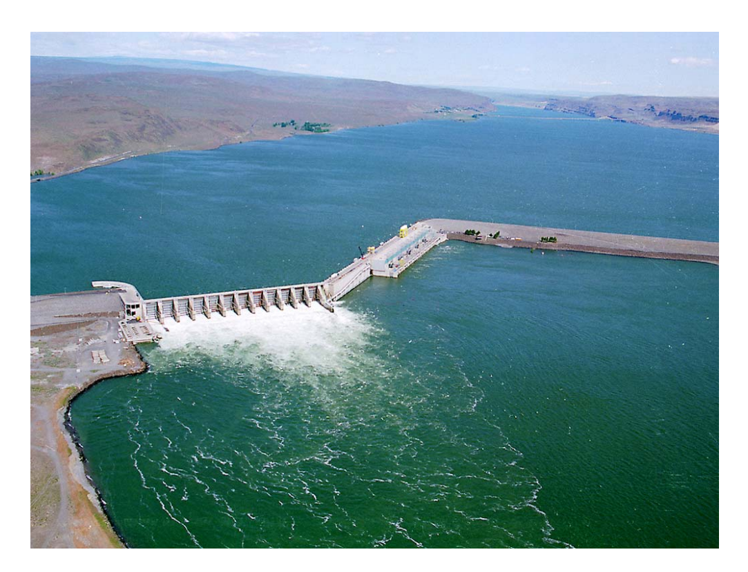
Figure E-6. Wanapum Dam