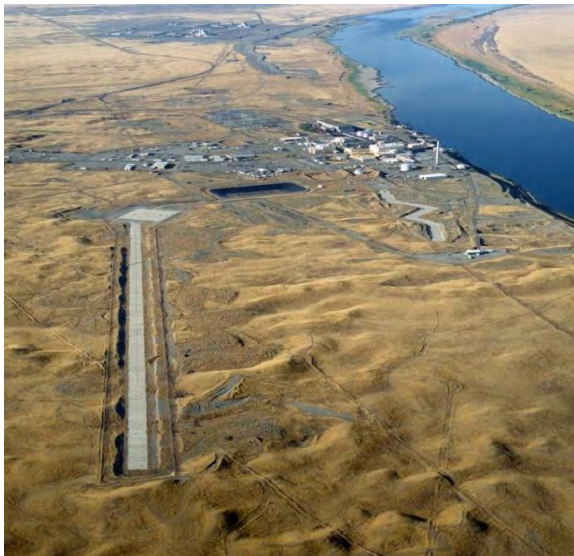
Cribs that discharged strontium near N Reactor.

In 2007 workers injected a mix with a low-concentration of apatite-forming minerals. In 2008 they injected a mix with a high-concentration of apatite-forming minerals.