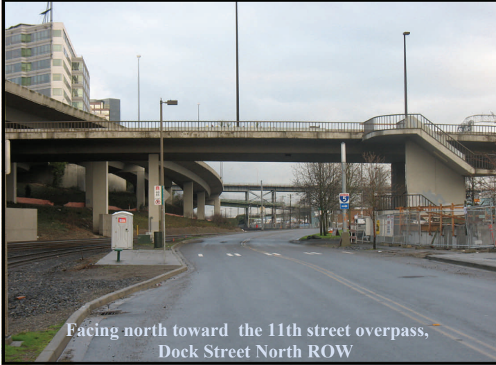
Facing north toward the 11th street overpass, Dock Street North ROW

Site cleanup standards, construction activities, and regulations described in the SCAP will be used for the entire Dock Street North ROW project (see map on page 3).