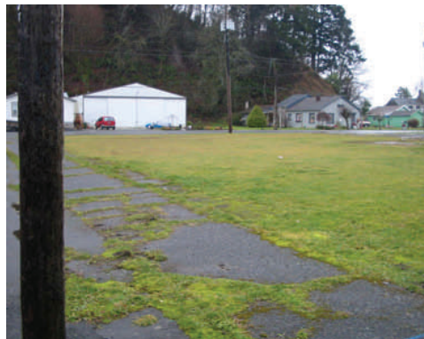
Most Western Laundry site, facing south-east towards 16th street

Public comments will be used, along with data collected during the remedial investigation, to help decide if more sampling should be done.