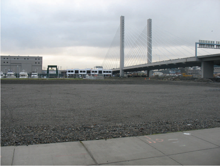
Parcel 10, Site 1 - Facing the Thea Foss Waterway and 21st street bridge.

http://www.ecy.wa.gov/programs/tcp/sites/thea_foss/tacoma_redev_prop.htm .