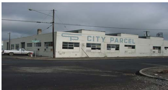
708 N. Cook Street