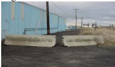
Alleyway East of Building

The alleyway is a City of Spokane right-of-way. Ecology asked the City to install a temporary gravel