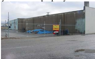
Parking area on North side of Building

PCB contamination is found inside the building in dry wells, an underground storage tank, and drain lines. Studies show the groundwater is not impacted, but there is extensive contamination in soil from 0 to 12 inches below the ground surface. Contaminated soil is located in the gravel parking area on the north side of the building and in the alleyway east of the property.