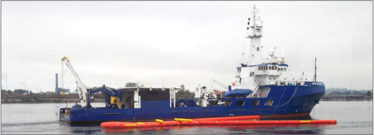
The Oregon Response and Current Buster booming system during an on-water equipment exercise. All equipment is listed on the WRRL.